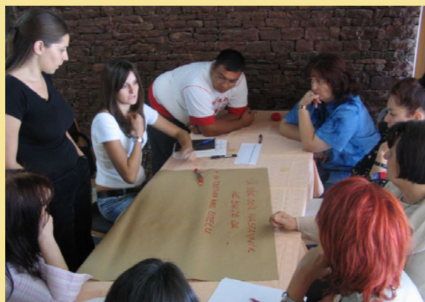
Adult education makes use of the life experience the learners already have. At a teacher training seminar in Sutomore in September 2007, the teachers of six literacy courses learned how this works in practice.