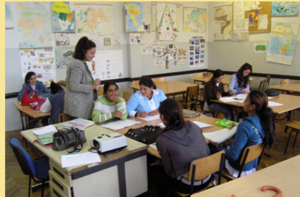
The female class in the Marko Miljanov primary school in Podgorica, October 2007. Contrary to the initial project plan, men and women are taught in separate classes.