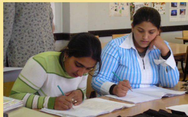
Writing needs attention, even for learners outside the usual school age.