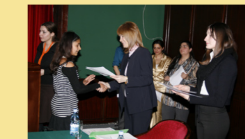
In March 2008, 60 Roma received their diploma of basic education, corresponding to four years of primary school.